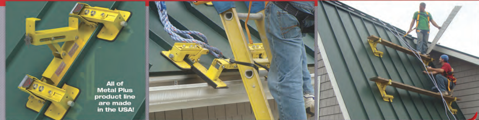
All of Metal Plus product line are made in the USA!

THE WORLD'S BEST STANDING SEAM METAL ROOFING BRACKETS!